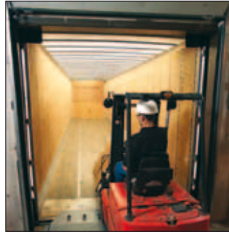
Ordinary shelter leaves trailer door hinge gaps exposed

Ordinary shelters can't seal the hinge gaps created by swing-out trailer doors. Unsealed, these gaps equal about 0.6 m 2 of open air. Eliminator-GapMaster, however, seals these gaps. Depending on climate, you can save as much as $1000 per year, per dock position, in recovered energy costs. Plus, sealing open hinge gaps helps eliminate "white space" at the dock, minimizing dust and insect infiltration and making inspections easier to pass.