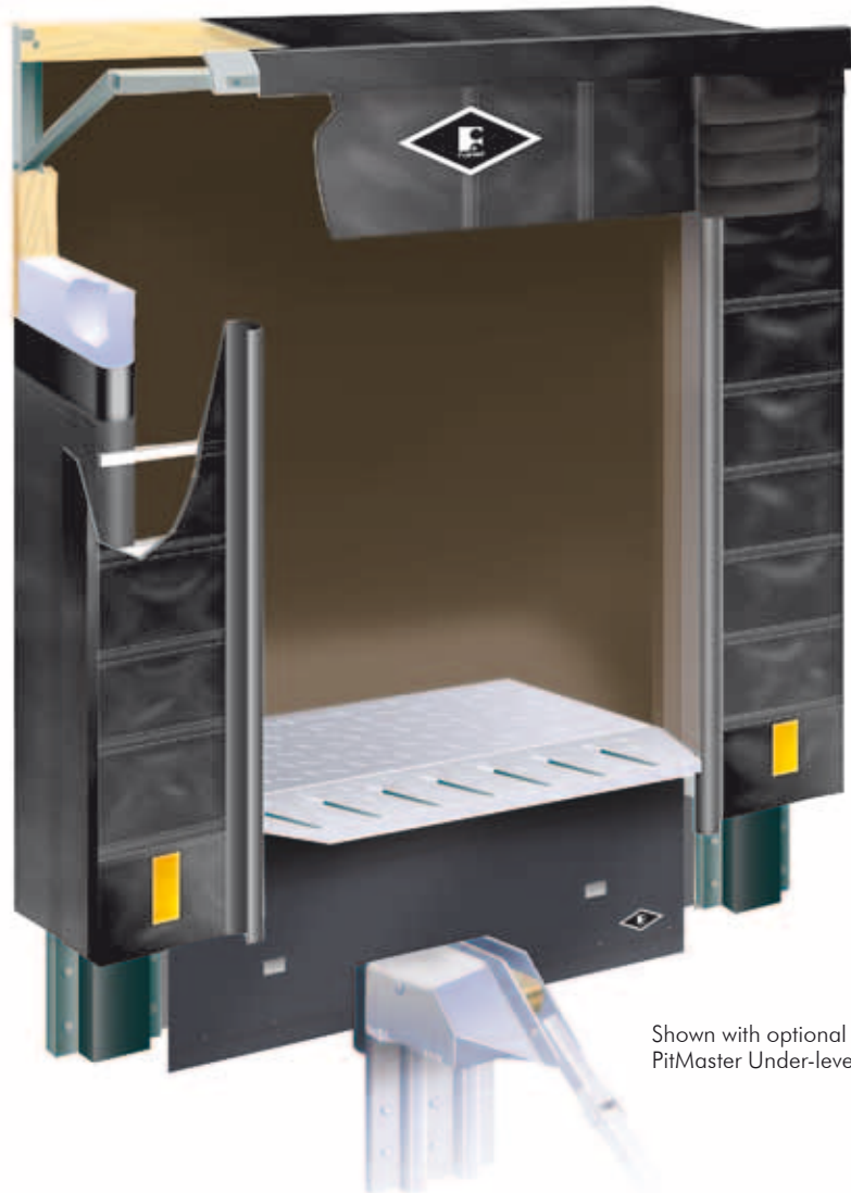
Shown with optional PitMaster Under-leveler Seal

Heat-dissipating technology in head curtain prevents burning from hot trailer marker lights. (Optional)