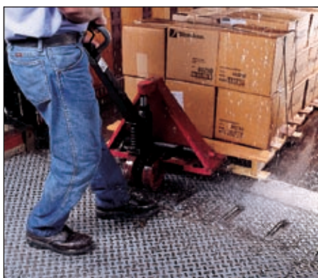
Poor seals can mean wet, icy floors and dock levelers – hazardous to personnel and equipment.

The latest advanced features give the RG-3000 higher durability and better sealing efficiency than any other rain-diverting seal available. A tight, consistent seal across the full width of the trailer top, plus built-in protection against damage and wear, make the RainGuard RG-3000 your best guaranteed value. Products, people and equipment stay dry with the rugged RainGuard RG-3000.