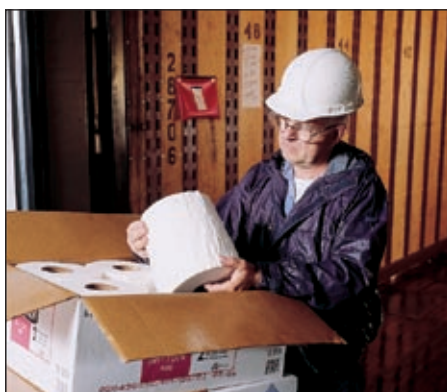
Inadequate seals can cause water damage and product contamination.